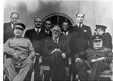
The "Big Three" on Nov. 29, 1943, in Tehran

This neutralization - to be understood literally - could be effected in different ways. One way was the biological extinction of the German people, proposed, for example, by Theodore Nathan Kaufman, president of the American Federation of Peace. He belonged to the circle of Roosevelt's closest advisors and had direct influence on the decisions of the US President. In 1940, ten months before the US officially entered the Second World War, Kaufman published a book with the title Germany Must Perish . This little book dripping with hatred contains what has come to be known as the Kaufman plan, the scheme by which this Presidential advisor recommended the extermination of 70 million people of the German nation, including women and children, and the distribution of the German Empire among its neighbors. Specifically, the book stated:[24]