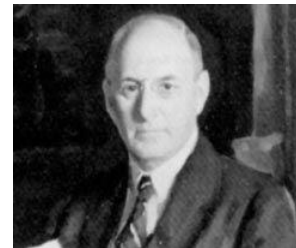
Henry Morgenthau, Jr.

"Peace can come to the world only by the total elimination of German and Japanese war power. [...] The elimination of German, Japanese, and Italian war power means the unconditional surrender by Germany, Italy, and Japan. That means a reasonable assurance of future world peace."